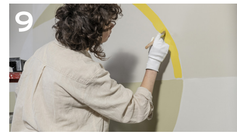
Make sure to use a paint brush to cut in.