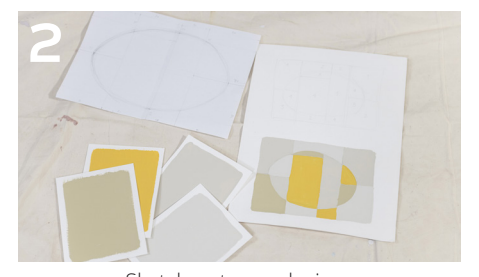
Sketch out your designs and then choose your favourite.