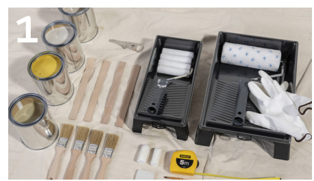
Gather your paint materials.