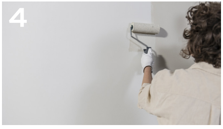
Paint your first colour with a roller. This acts as a base layer.

All the colours in our 2025 collection are made to work together. By creating a freeform shape with multiple colours, you can create a subtle but striking feature wall. Follow our easy step-by-step guide to discover how to do it or read the article and watch the accompanying video at dulux.com