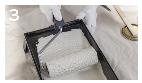
Prepare your base colour (the one which is used most).