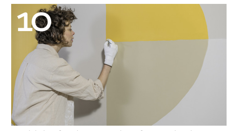
Add the finishing touches for a tight design.