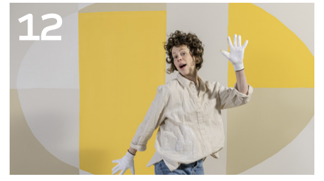
Celebrate and enjoy the end result for years to come.