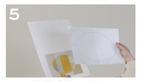
Double check your design.

All the colours in our 2025 collection are made to work together. By creating a freeform shape with multiple colours, you can create a subtle but striking feature wall. Follow our easy step-by-step guide to discover how to do it or read the article and watch the accompanying video at dulux.com