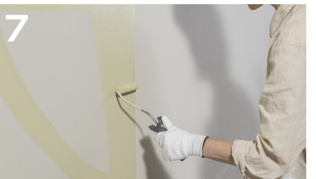
Freehand your shape and then apply your second colour.